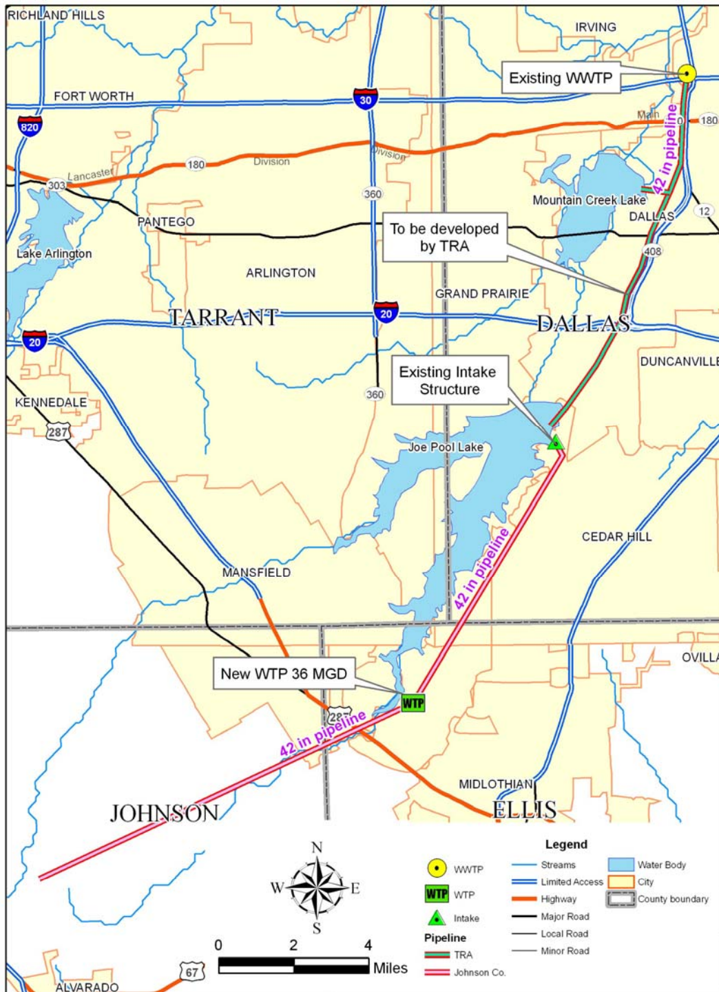
Figure 4B.11.1-1. TRA Reuse Project to Johnson County SUD